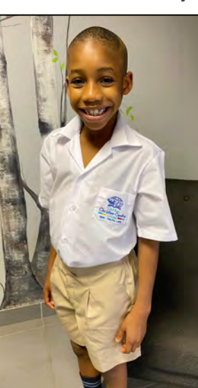
Boys Golf shirt will be worn daily White plaid collar with Sand Pants, pictured above will be worn on formal occasions