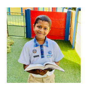
Welcome to Faith O'Clock!