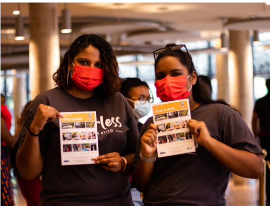
Furthermore, we painted the town red on Red Sunday, on which we promoted our School for our annual open day at the DCC Jesus Dome and welcomed many new people into our growing family.